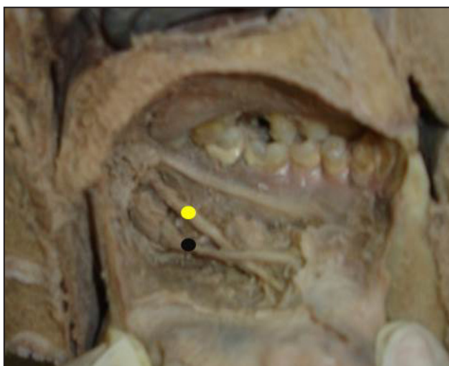
Figure 2. Image showing the intersection point between LN (yellow) and the submandibular gland duct (black).

and the mandibular plate, at the level of the third molar socket (Figure 3 and Table 1). This result was greater than that found by Pogrel et al. [12] (3.45 mm; SD 1.48 mm), by Behnia et al. [14] (2.06 mm; SD 1.1 mm) and by Hölzle and Wolff [13] (0.86 mm; SD 1 mm). Kiesselbach and Chamberlain [15] found a horizontal distance of 0.59 mm (SD 0.9 mm) between the LN and the mandibular lingual plate. Miloro et al. [16] found this same relationship with 2.53 mm (SD 1.48 mm). These distances are smaller than those found in the present study. This can be justified for the size of our sample, since in the Behnia et al. study [14] it involved 669 LNs in 430 corpses with a maximum of 24h post-mortem. Our specimens were conserved by immersion in 10% formaldehyde, with a time of immersion varying from 2 to 5 years, which might cause changes in the tissue volume of the analyzed parts.