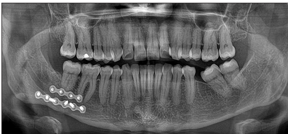
Figure 3. Postoperative panoramic radiograph after the fixation of the mandibular fracture registered within 1-year follow-up.

The field of oral and maxillofacial surgery has an especial condition in the spotlight of justice due to the important risks involved within each procedure. Despite the differences in legal proceedings and ethical guidelines inherent to country-specific laws and professional regulatory bodies,