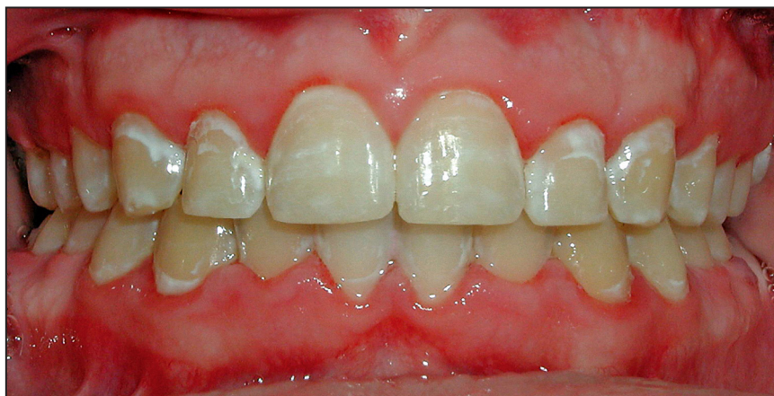
Figure 1. White spot lesions after orthodontic treatment with fixed appliances.

Evaluating the results of scientific researches hypothesis arises if it is possible to prevent